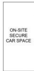
ON-SITE SECURE CAR SPACE

542B/6 COWPER WHARF ROADWAY WOOLLOOMOOLOO