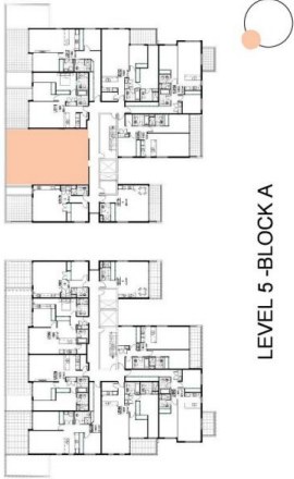
LEVEL 5 -BLOCK A

Area quoted to be used as guide only. This plan is for illustration purposes only. All information contained is gathered from sources deemed to be reliable. We have no doubt it is accurate however we cannot guarantee it. Areas are subject to final survey. Layout may change due to final council approval. The marketing plan and strata plan area will vary because of the different methods of calculation adopted. The marketing plan area is based on the floor areas while the strata plan area is based on Strata Schemes (Freehold Development) Act 1973. Note: Store(s), Robe(s), Linen(L), Bath fixture(s) & Kitchen joinery fixture(s) form part of sales package. TV and other items such as credenza, sofa, study desk, TV units & beds are not included as part of sale. Windows and doors sizes are indicative and subject to change based on legislative approval.