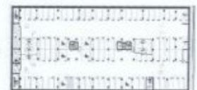
CARPARKING - BASEMENT 3