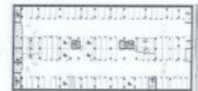
CARPARKING - BASEMENT 3