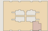
SAFARI I - LEVEL 4

ROYAL SHORES DISPLAY CENTRE 1 Burdarra Street, Ermington NSW 2115 P 1300 888 558 W royalshores.com.au