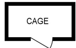
LEVEL ONE NO.330

APPROX. INT. AREA : 73 m 2 APPROX. EXT. AREA : 7 m 2 TOTAL AREA INCLUDING CAR SPACE AND STORAGE : 95 m 2