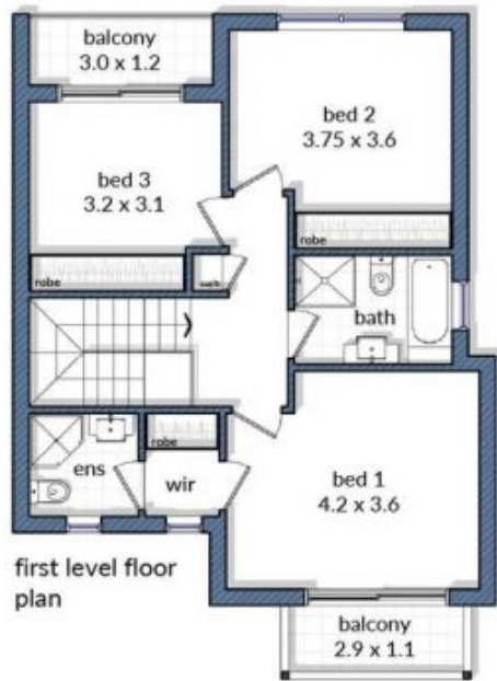
first level floor plan