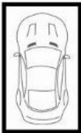
Basement Secure Car Space