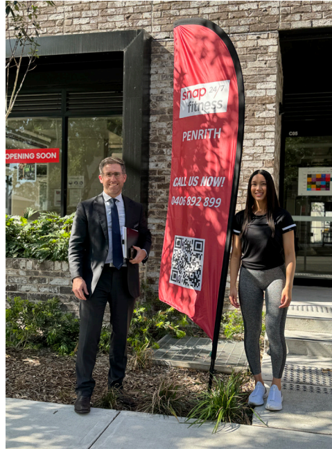
Snap Fitness 24/7 Penrith