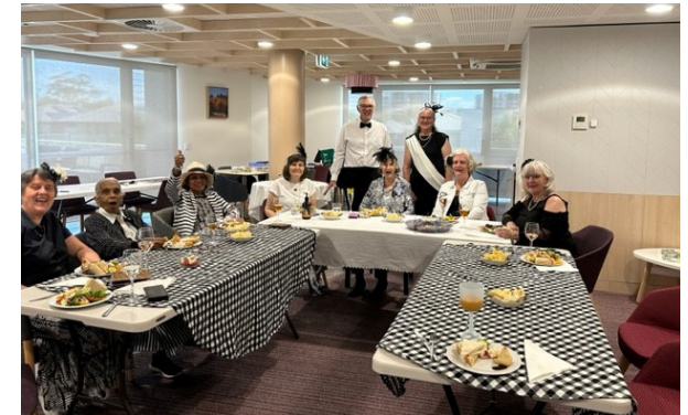
TCG Melbourne Cup Luncheon

Dress up in your favourite Aussie Day Historical Outfit!